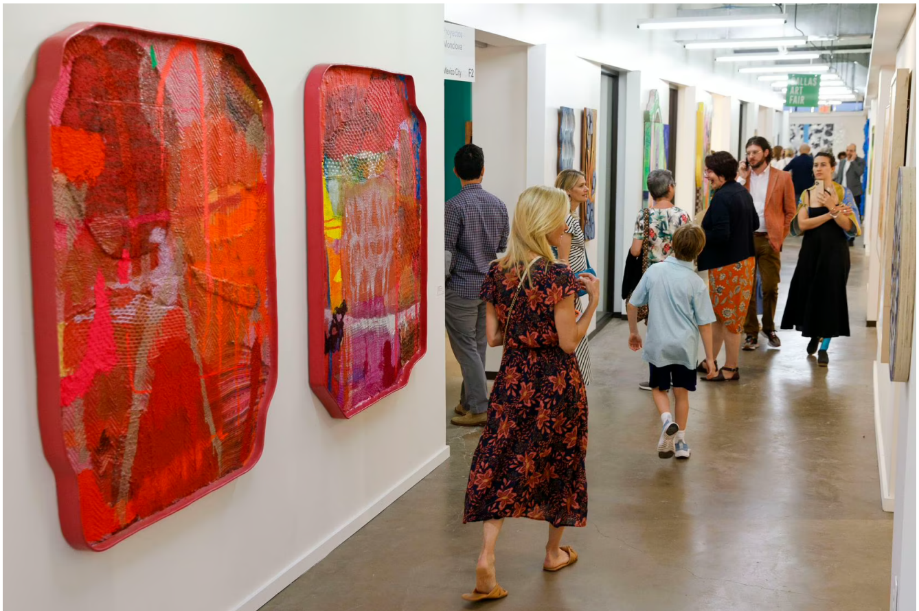
People browse artwork from different galleries at the Dallas Art Fair at the Fashion Industry Gallery on Thursday, April 20, 2023 in Dallas.