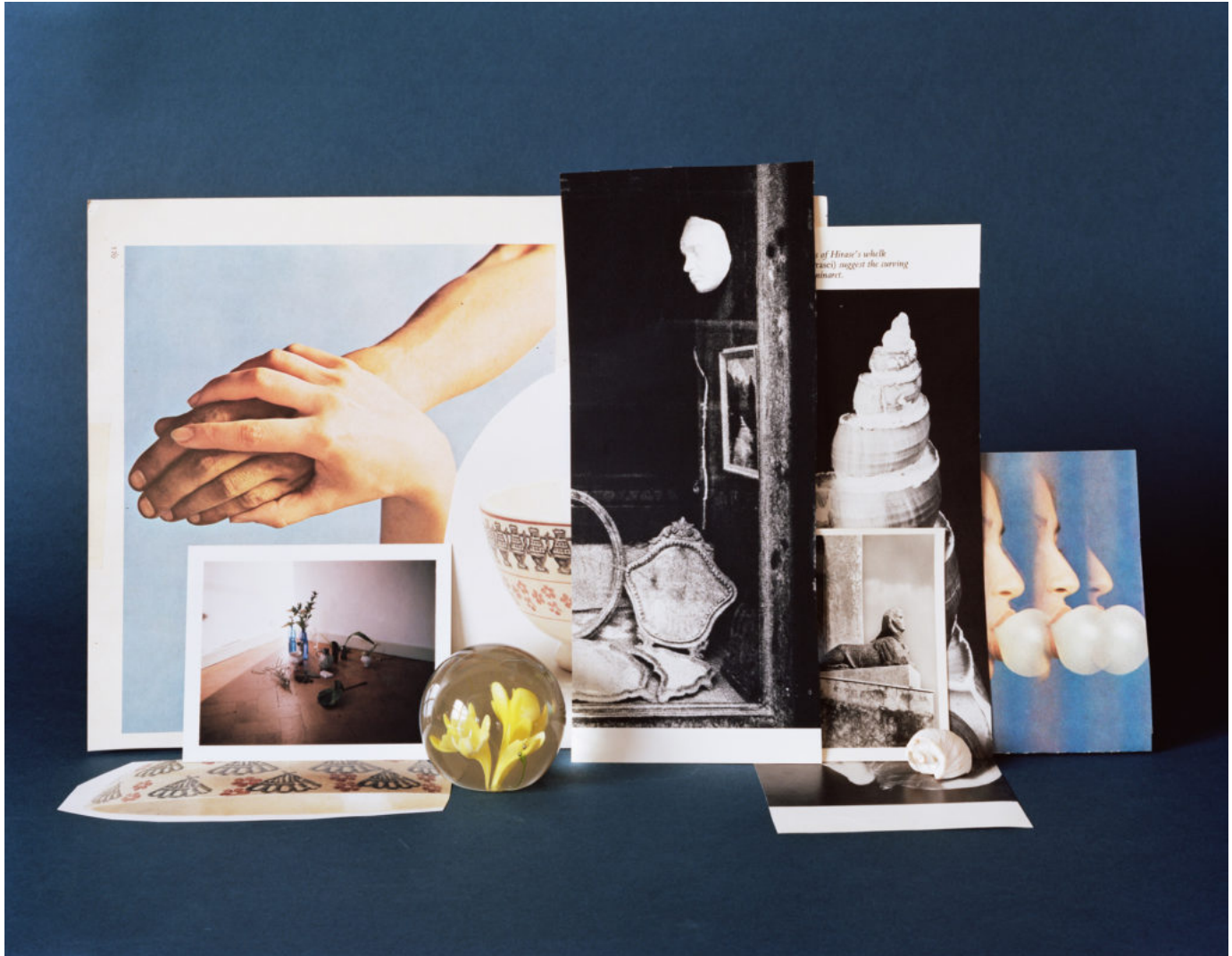
Celia Perrin Sidarous, Assemblage en bleu (sphinx) , 2019. Inkjet print on matte paper, 48 x 61.4 inches. Purchased by the AGO with funds from the Dr. Michael Braudo Canadian Contemporary Art Fund and the Art Toronto Opening night Preview.

Particules , an artwork made of 11,000 image fragments representing crowds taken from all continents at mass demonstrations, festivities and sports events.