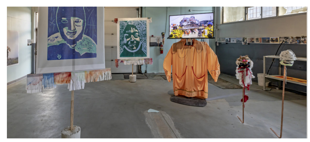
Embassy of Imagination + PA System, Sinaaqpagiaqtuut/The Long-Cut, 2019, mixed-media installation. Commissioned by the Toronto Biennial of Art. Presented in partnership with The Bentway. On view at 259 Lake Shore Blvd E as part of the Toronto Biennial of Art (2019).