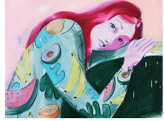
Sarah Letovsky, Still life with Fruit, 2016, oil on canvas, 30" x 40". Courtesy of Project Gallery